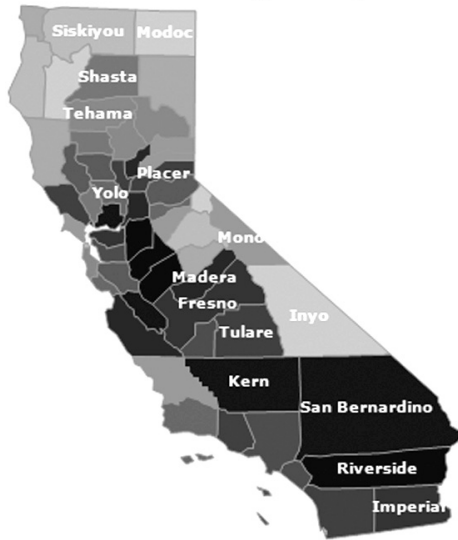
Properties with Foreclosure Filings in August, 2008